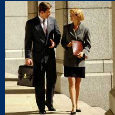
MAN/WOMAN WALKING, IN SUITS