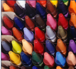
CRAYONS/FLAGS/CIRCLE OF HANDS