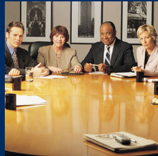
DIVERSE CONFERENCE ROOM