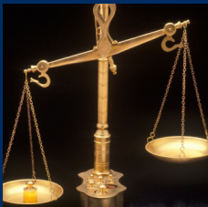
SCALES OF JUSTICE